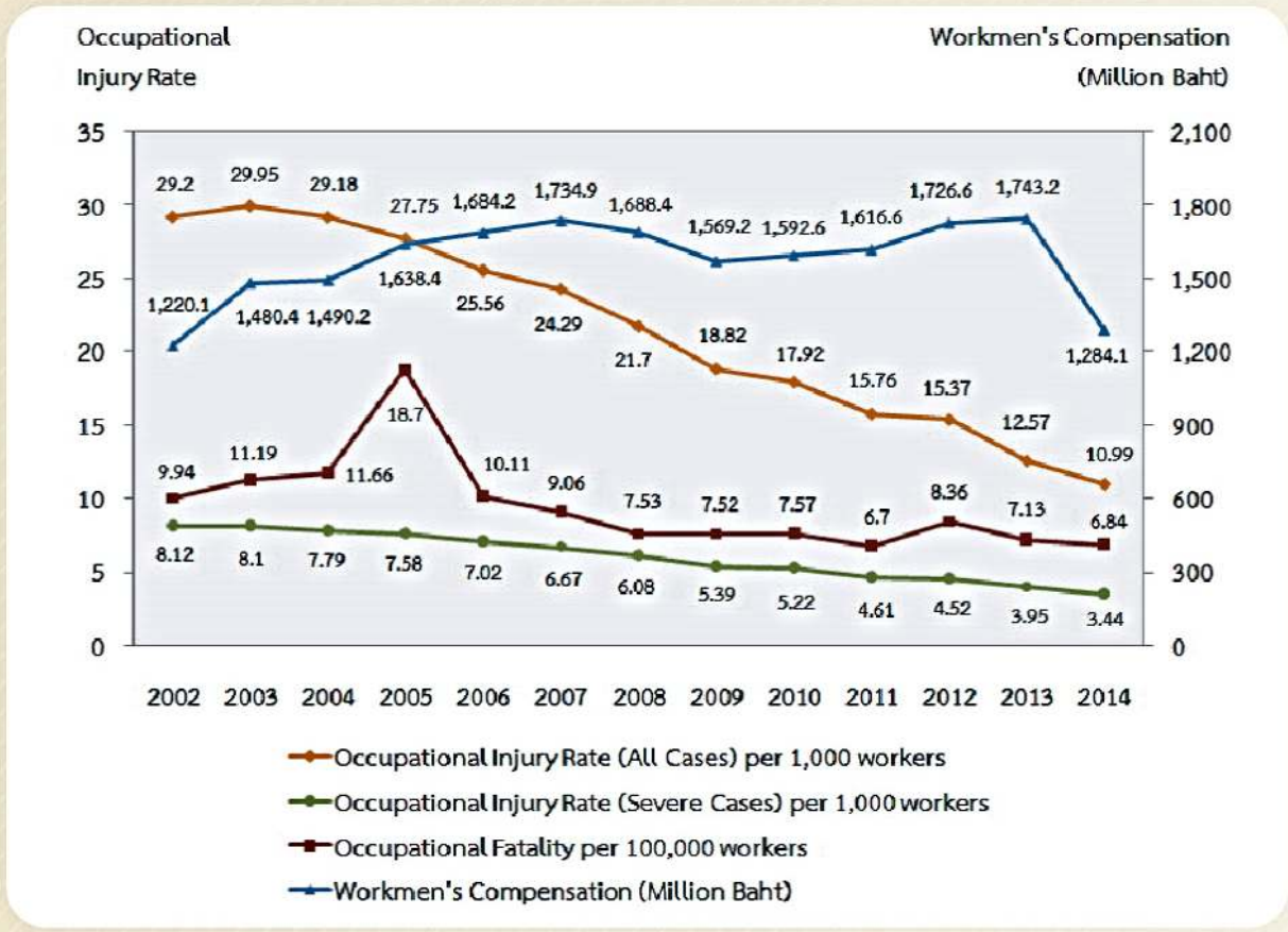
Figure 2-1 Trend of Occupational Injury Rates by Severity and Workmen's Compensation, 2002 - 2014

Figure 2-1 indicates that during 2002 – 2014, occupational accident and injury rates per 1,000 workers for all cases and for severe cases reduce significantly. In the mean time, occupational fatality rates tended to reduce after 2005 but slightly increased in 2012, with decreasing trend afterwards. The amounts of compensation paid, in overall, has increased although the figure shows a sharp drop in 2014 (but a number of cases was still not closed at the end of December 2014 so that actual total payment is expected to be much higher than the amount currently reported).